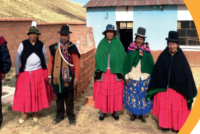
Recipients of the Rotary-sponsored Comanche Eco-sanitation project in West-Bolivia.