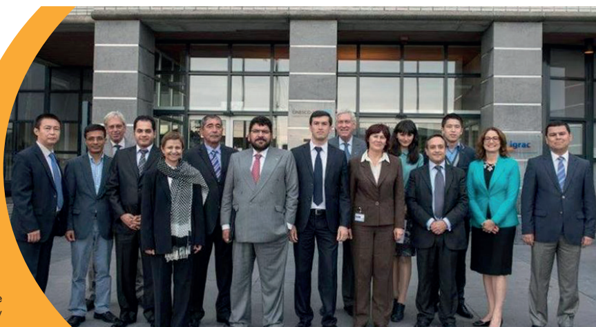
Participants of the 2014 Rotary-sponsored Central Asia workshop on preventive diplomacy for transboundary water management.